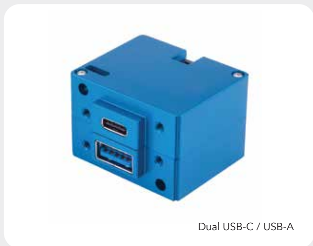
Dual USB-C / USB-A

High power TA202 Series Chargers simultaneously provides 15 watts / 3 amps of power per charging port to electronic devices.